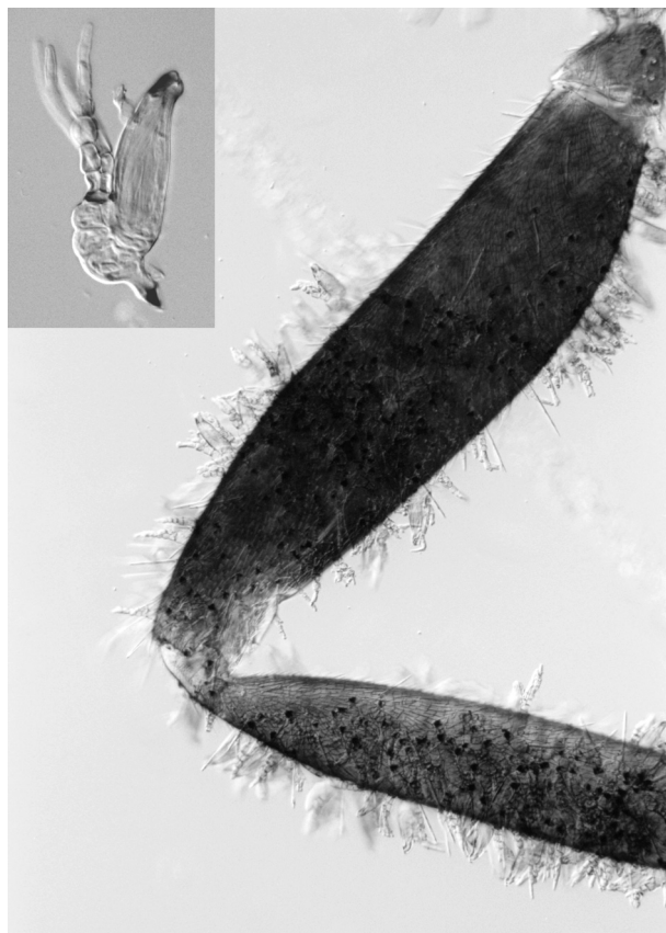
Fig. 1. – Thalli of Laboulbenia formicarum on a Lasius leg. Inset: mature specimen.

Here we provide three distant locations in France for an exotic species of Laboulbeniales, Laboulbenia formicarum Thaxter (Fig. 1), apparently originating from North America. In this last region the fungus has been known since its description by Thaxter (1908). Presently known data show that the fungus is noted on five genera in North America ( Formica , Lasius (+ Acanthomyops ), Myrmecocystus , Polyergus and Prenolepis ) and 17 species of ants, all belonging to the subfamily Formicinae, tribes Formicini and Lasiini (Bequaert 1920, Cole 1935, 1949, Benjamin & Shanor 1950, Judd & Benjamin 1958, Nuhn & Van Dyke 1979, Smith 1917, 1928, 1946, 1961, Wheeler 1910). Its distribution is widespread in North America (Fig. 2). After Nuhn & Van Dyke (1979) the species remained elusive until it was detected at São Vicente (Madeira, Portugal) growing on Lasius grandis