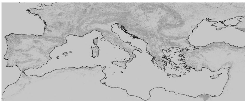
Fig. 1. Results for the Mediterranean Basin from time-series analysis of Landsat 7 ETM+ images in characterizing global forest extent and change from 2000 through 2012 (Hansen et al., 2013). Dark grey: forest cover in 2000; black: gain forest from 2000 to 2012; white: forest lost from 2000 to 2012. It is difficult to appreciate forest gain and losses due to the scattered nature of the process in the Region although lower scales could be accessed in the original webpage: http://earthenginepartners.appspot.com/science-2013-global-forest .

(Bendel et al., 2006; Retana et al., 2002). Second, the higher fire frequency and intensity in fire-prone areas might result in: (i) a decrease in the resprouting ability of plants and reduced resilience at the landscape level of forests dominated by resprouters (Díaz-Delgado et al., 2002; Marzano et al., 2012); (ii) a failure of obligate seeders regeneration when time intervals between fires are shorter than the time required for a sufficient seed bank to build up ('immaturity risk', sensu Zedler, 1995).